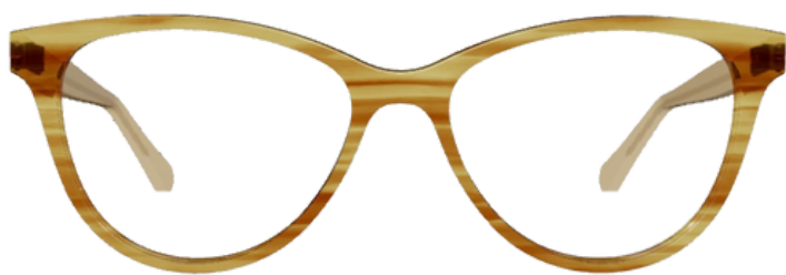
O-SIX OV111 C0486

100% Recyclable Acetate. Handmade in Cadore, Italy