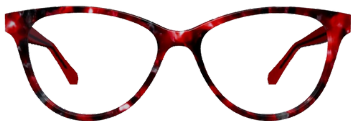
O-SIX OV111 C0985

100% Recyclable Acetate. Handmade in Cadore, Italy